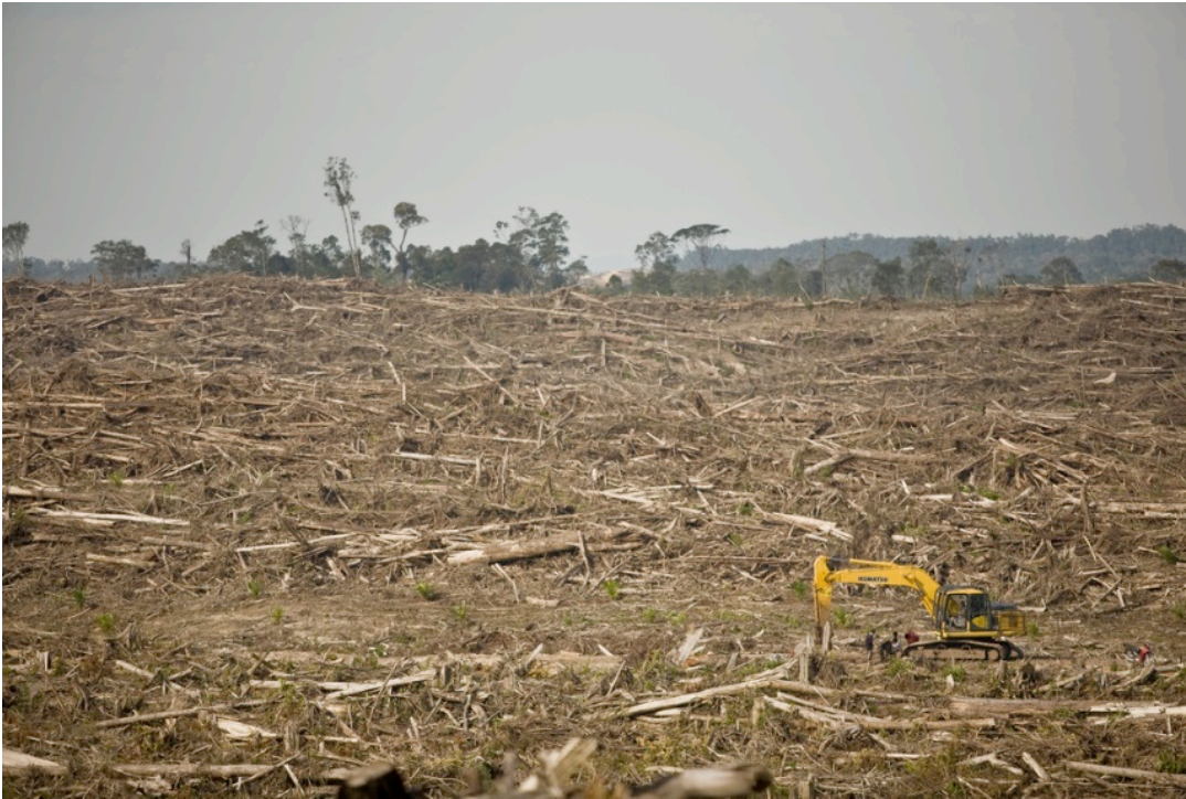
Figure 4 Deforestation in West Kalimantan, Indonesia

Therefore, it's evidently counterintuitive to consider using palm oil for biodiesel production in order to offset greenhouse gas emissions. For this reason, hemp can also be used as alternative to biodiesel production from palm oil.