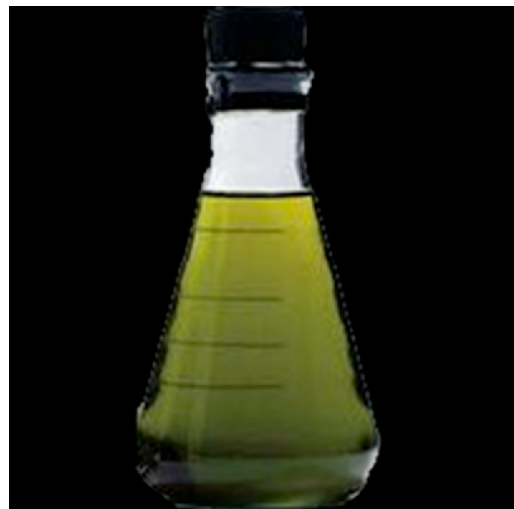
Figure 3 Hemp Biodiesel is known for its distinctive green color

The flash point is the minimum temperature calculated to a barometric pressure of 101.2 kPa at which the fuel will ignite under specific conditions. It is used to classify fuels for