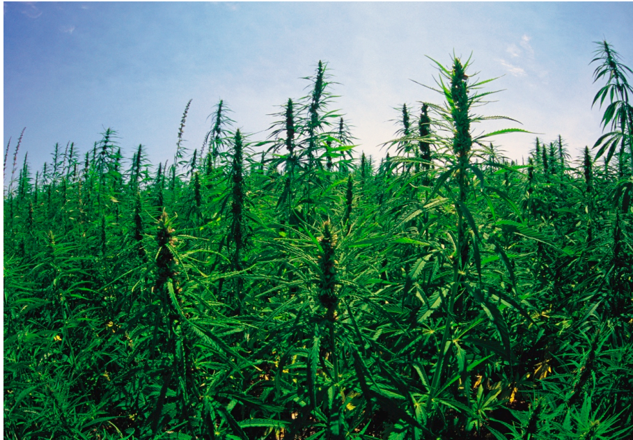
Figure 1: A Field of Cannabis Sativa L. (Industrial Hemp).

Biodiesel is a renewable energy alternative to fossil fuels that is composed of a group of long chain fatty acids called mono-alkyl esters. It is a highly efficient diesel replacement that is produced by a process called transesterification, a chemical reaction between vegetable or animal fat and alcohol in the presence of a catalyst to produce biodiesel (Mannan, et al. 2006). Unlike diesel produced from petroleum, it contains very low level of sulfur, which produces sulfur oxide ( SO_x ) emissions when burned, a major precursor to acid rain (He, et al. 2009). Additionally, biodiesel requires no modifications to the diesel engine.