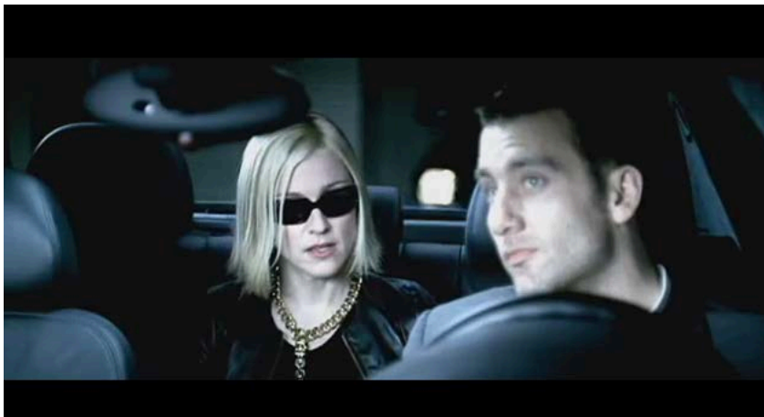
Figure 7. Clive Owen and Madonna in "Star" – one of the episodes in The Hire.

Watching the episodes one can clearly see that BMW wanted to emphasize the different aspects of the cars and how it handled in various situations. The engaging factor of the campaign is the entertainment value that the short films have and this is also true for the rewarding factor. Although the reward was little for watching the videos the users of the website had a new short film to look forward to in the future. Even though the website held no especially social part the campaign surely held it, in the true spirit of WOM marketing, through the spread of the videos by the users themselves. This campaign surely manages a viral spread and as Hespos (2002) states “never before (or since) had an automotive company taken such a strong stance to drive consumers to the Web...”