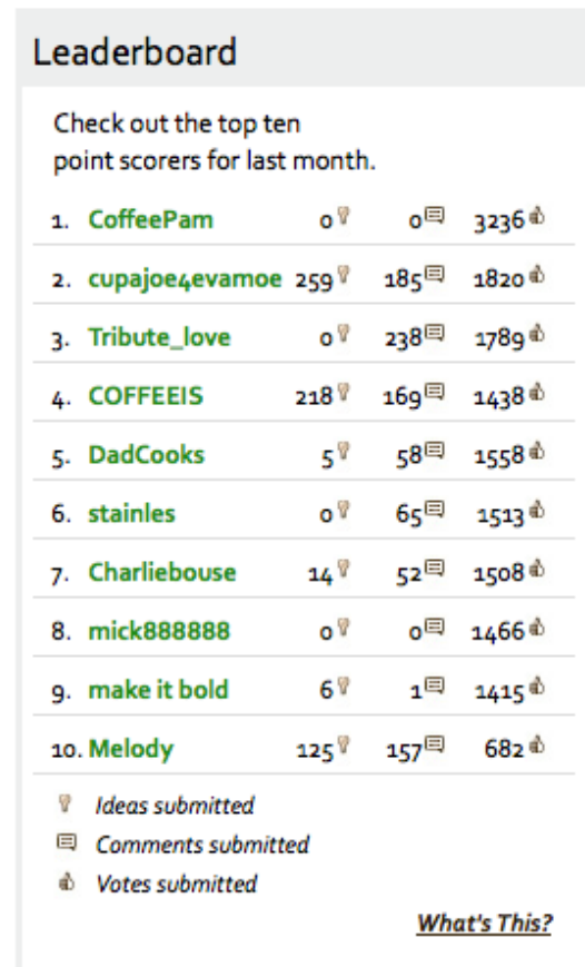
Figure 5. Leaderboard on My Starbucks Idea

Instead of using already established communities, Starbucks is making their own for their own target audience. The benefits of doing this is that Starbucks gain more control of the interface and functions so that they can create the most suitable site for the purpose: sharing, commenting and voting on ideas. The disadvantage is that you are not making use of already established communities, where your customers are likely to be at, and feel familiar with. Now, the audience will have to make a new Starbucks.com account for this sole purpose, which could be a tiresome process for some, depending on how active in the community you are expecting to be. But Starbucks is using other social media sites in some ways. A feature called “Give a Gift” was announced in mid 2010 that let Facebook members give away pre-paid Starbucks card to their friends, worth between $5 and $500. This feature is actually one of many ideas that are to found on My Starbucks Idea produced by a user. All ideas can be shared on many different social media sites by a share button. My Starbucks Idea also has their own Twitter account, sharing news and answering other Twitter users questions. According to our terms of social factor, My Starbucks Idea is considered using a high social integration.