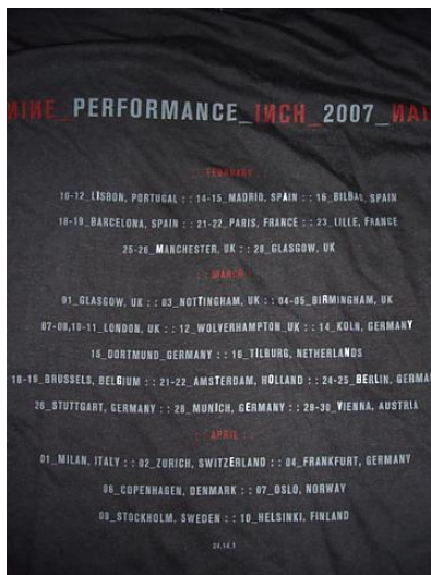
Figure 6. Nine Inch Nails tour t-shirt.