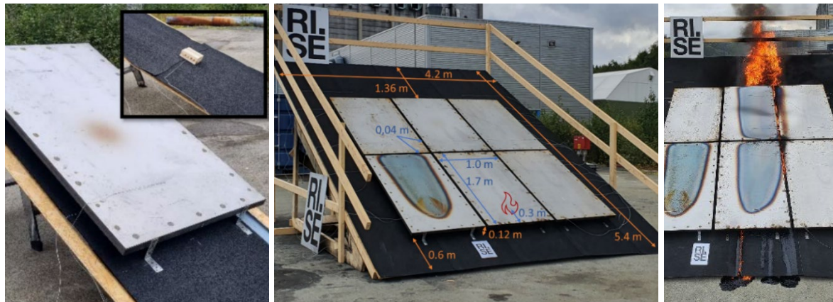
Figure 2. Medium-scale experiments with a wood crib placed on top of a roofing membrane with a steel plate (left) and without a steel plate (left inserted). Large-scale experiment with steel plates on a roof measuring 4.2 \times 5.4 m (middle). Fire propagation in large-scale approximately 20 minutes after ignition where the fire has spread up to the top of the roof (red arrow) and down to the lower edge in the flowing melted bitumen roofing membrane (white arrow) (right).

according to EN 13501-2 [13]. The total duration of the experiments was approximately 60 minutes until the fires self-extinguished when the roofing membrane was burned up.