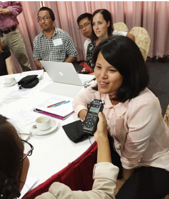
Community radio might soon be introduced in Myanmar, and for this reason several trainings have been held.

towards mainstreaming gender and diversity.