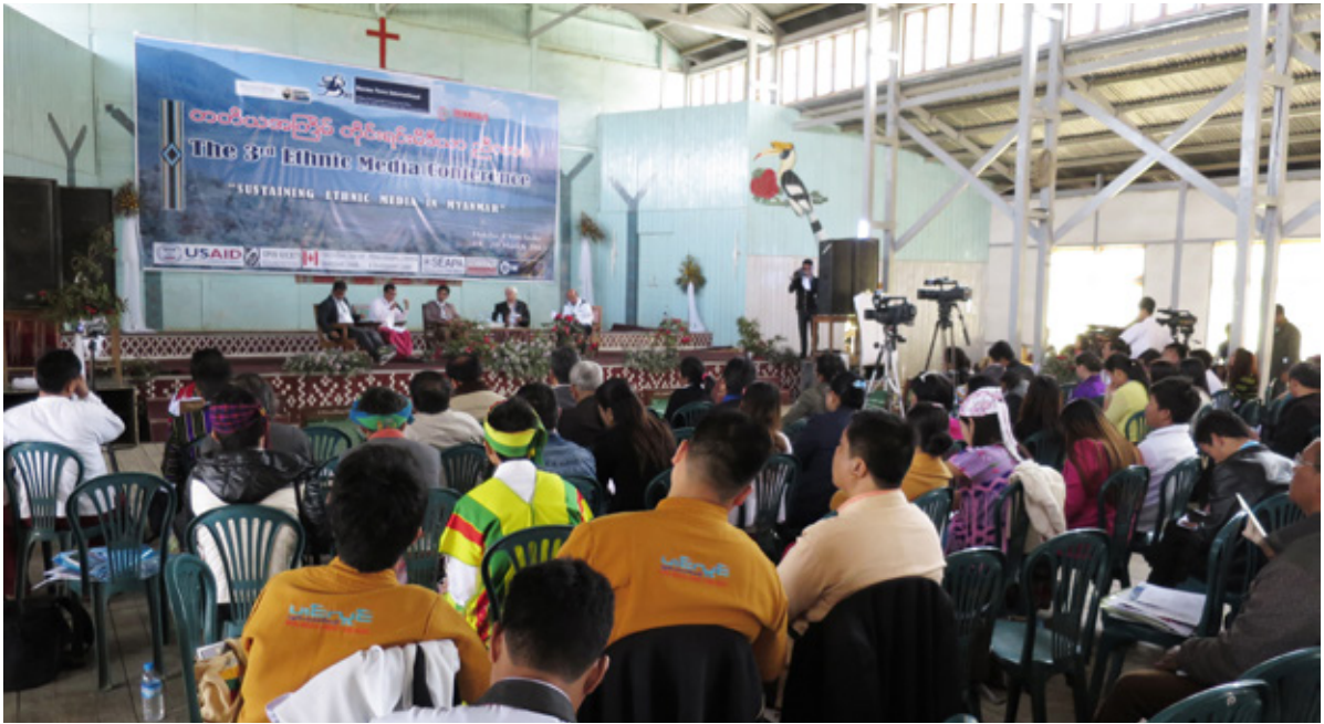
Burma News International gathers ethnic media outlets at an annual conference to discuss the challenges in reporting in a minority language.