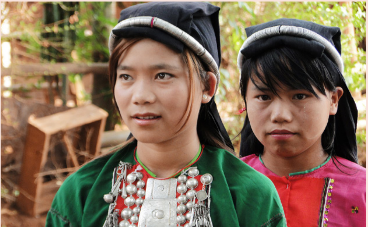
Karen girls in Shan state.