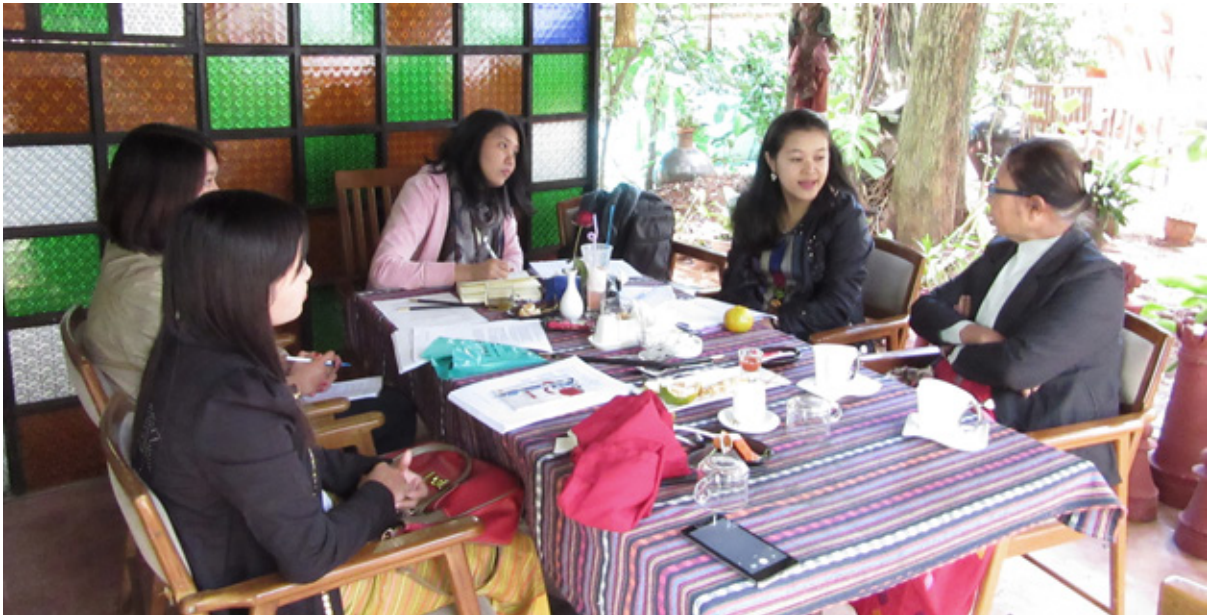
A women-only focus group discussion.

even reserves some positions for men only; further limiting the participation of women in political life. As a result of the November 2015 elections, 13% of the newly elected Members of Parliament are women, up from 4.6%. When the seats reserved for the military are included in the equation, this means that just 9.7% of the total number of seats will be filled by women. 3