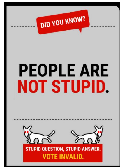
Figure 16 An example of a poster from the joke party's billboard campaign against the referendum campaign of the government. Reconstructed with English translation by the author. (Kétfarkú Kutya Párt, 2016)

The rhetoric shift from attacking refugees to attacking Brussels can be also justified by the words of Viktor Orbán towards the end of the referendum campaign, when he said that the real problem is not with the refugees but with the bureaucrats in Brussels (Nyilas, 2016). The campaigning against Brussels continued in 2017 as well, as the Hungarian government organised another national consultation with the title 'Let's stop Brussels!', this time to defend Hungary's sovereignty in deciding on questions related to taxation, unemployment, and energy prices against the oppressing Brussels (Kormány.hu, 2017b).