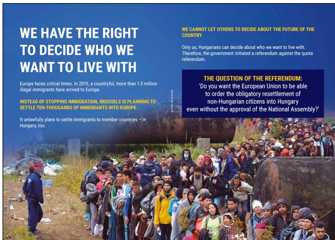
Figure 9 Page 2-3 of the referendum info booklet (Hungarian Government, 2016b). Reconstructed with English translation by the author