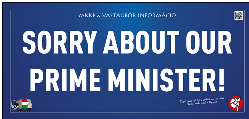
Figure 6 An example of a poster from the joke party's billboard campaign against the anti-immigration rhetoric of the government (Kétfarkú Kutya Párt and Vastagbőr, 2015)

However, this hasn't prevented Hungarians to change their attitude towards refugees and immigrants. TÁRKI Social Research (2016) Institute carried out a study about the social aspects of the immigration crisis in Hungary. TÁRKI reported that 'the rejection of the idea of an open society, in which scapegoating takes a central role, as well as fear ridden welfare chauvinism are strongly related, and are inseparable in people's minds' (pg.12). The organisation also highlighted that from 2014, the last data before the government's anti-immigration campaign to April 2015, the first data after the campaign, 'the level of xenophobia (...) immediately jumped to a very high level' (pg.12). 'In January 2016 the level of xenophobia reached an all time high' (pg.12).