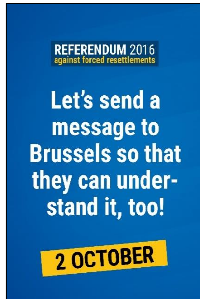
Figure 8 The cover of the referendum information booklet. (Hungarian Government, 2016b). Reconstructed with English translation by the author

The reason for analysing the referendum information booklet is because I believe it contained most of the messages communicated by the government in the run-up to the referendum during 2016 and similarly to the national consultation letter it has been sent out via post to all Hungarian citizens to take part in an initiative organised by the government. Figure 8 to 15, shows the pages of the booklet with English translation. Veczán (2016) analysis mostly consisted of fact-checking related to the statements in the information booklet, however this will not be the case with my analysis as I will stick to the approach of the three-dimensional model.