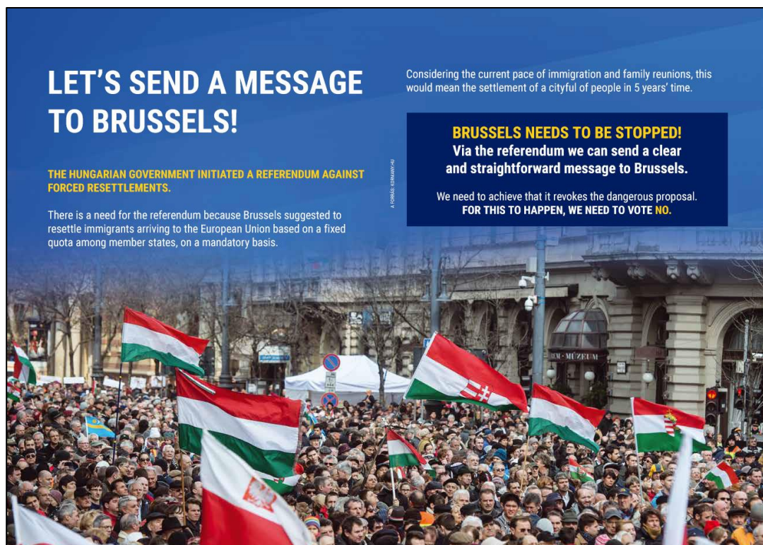
Figure 15 Page 14-15 of the referendum info booklet (Hungarian Government, 2016b). Reconstructed with English translation by the author