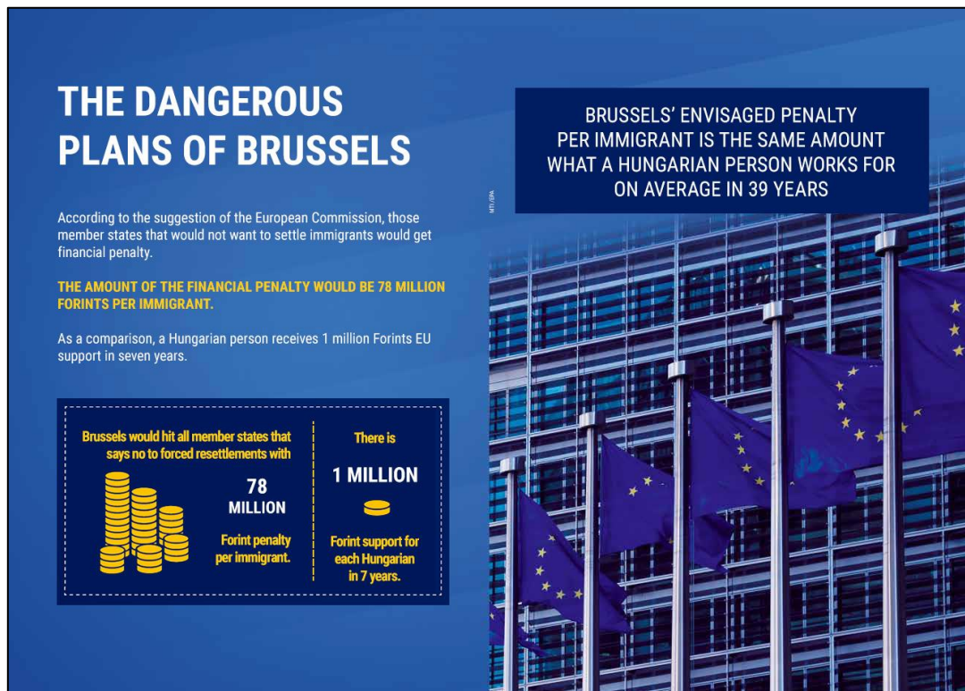
Figure 14 Page 12-13 of the referendum info booklet (Hungarian Government, 2016b). Reconstructed with English translation by the author