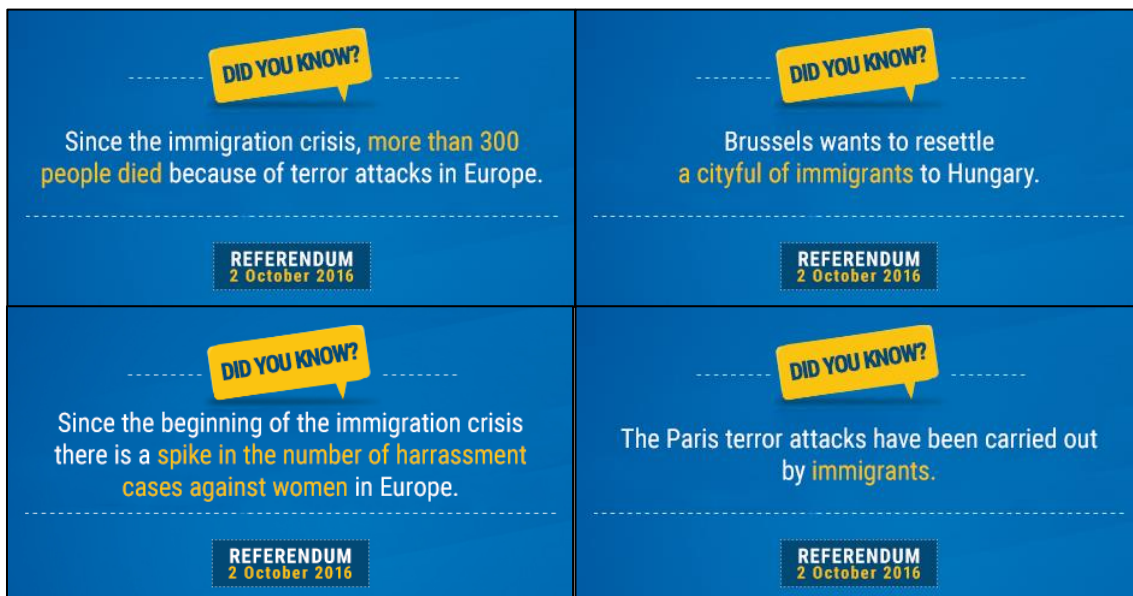
Figure 7 Examples of the messages from the 'Did you know?' billboard campaign (Hungarian Government, 2016a). Reconstructed with English translation by the author

The Hungarian government categorically refused to accept any quota system suggested by the European Union. Instead, in January 2016, it was announced that the government will organise a national referendum ‘against forced resettlements’ in October 2016, even though the resettlement scheme was still in development, therefore leaders of the EU member states were still discussing the details of the plan. In the run-up to the quota referendum, another billboard campaign was initiated by the government. The ‘Did you know?’ billboards (Figure 7) channelled information about immigration and ‘forced resettlements’ and reminded people about what is at stake.