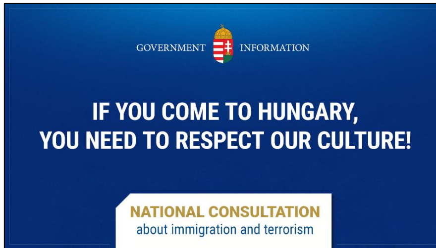
Figure 3 An example of a poster from the 'If you come to Hungary' billboard campaign. Reconstructed with the English translation by the author (Hungarian Government, 2015a)

Seemingly, these messages were aimed at refugees and immigrants, however, the messages were written in Hungarian, in a language that is most probably not understandable by them, but more so by Hungarians who could develop an attitude towards immigrants by reading these messages. There have also been many media appearances by government officials commenting (negatively) on the crisis to reinforce the messages and to keep the topic on the public agenda.