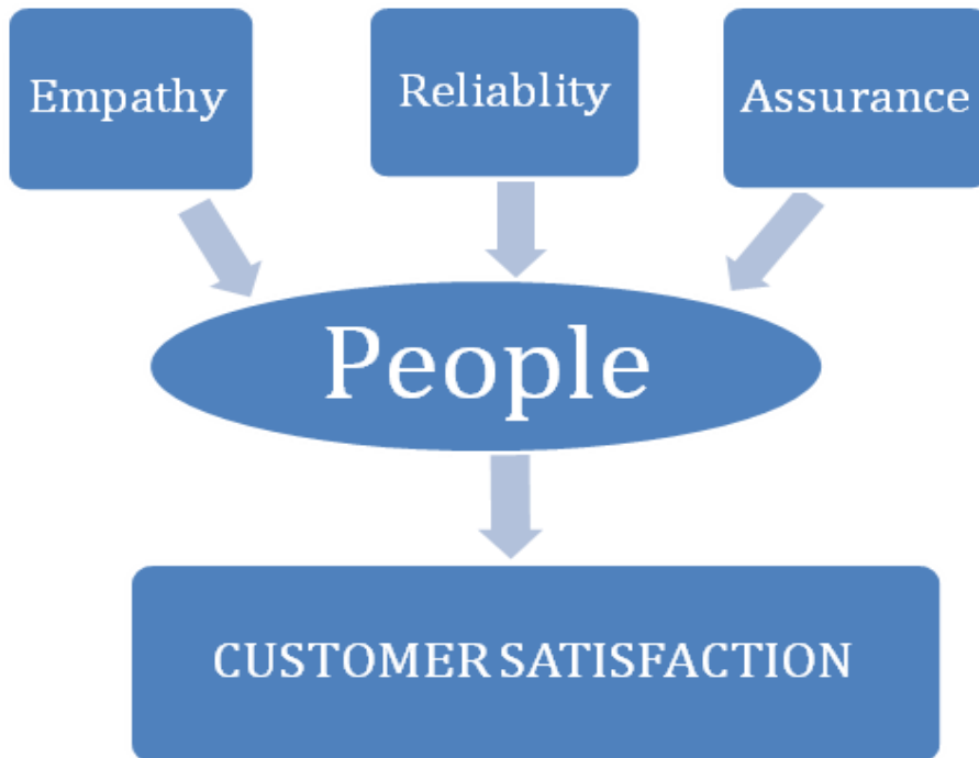
Figure 2 Theoretical Framework (Own construction)

The next chapter presents the research method used in achieving the aim of this study. This is in line with Borrego, Douglas, & Amelink (2009) suggestion that to fulfil the aim of a research, qualitative or mixed methods can be used.