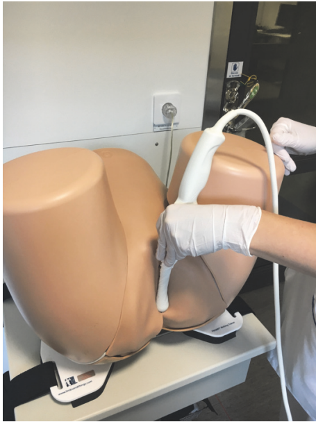
FIGURE 2: Transperineal ultrasound method to determine the anovaginal distance.