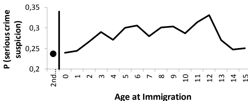
Figure 2. Probability of Suspicion for Serious Crime by Age at immigration.

Results: There is a peak in the probability of suspicion for a serious crime around age 12. In general, first generation immigrants have a higher probability of suspicion. See Figure 2.