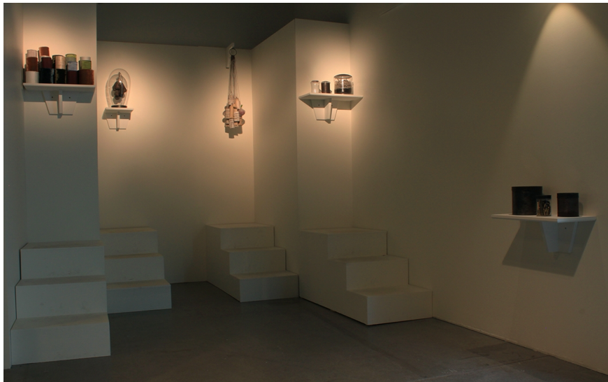
Memories of a parallel future, exhibition space at Konstfack spring exhibition 2014