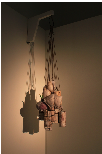
Bundle of rations