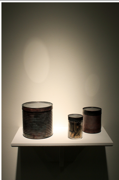
Canned cartridge shells