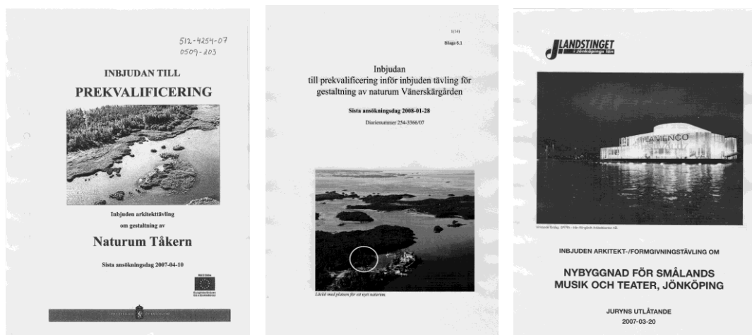
Figure 2: Front page to prequalified competitions for Exhibition building at Lake Tåken (2007) and at Lake Vänern (2008) to the left. To the right, Jury report 2007, front page from the prequalified competition for a new music and theatre in Jönköping.