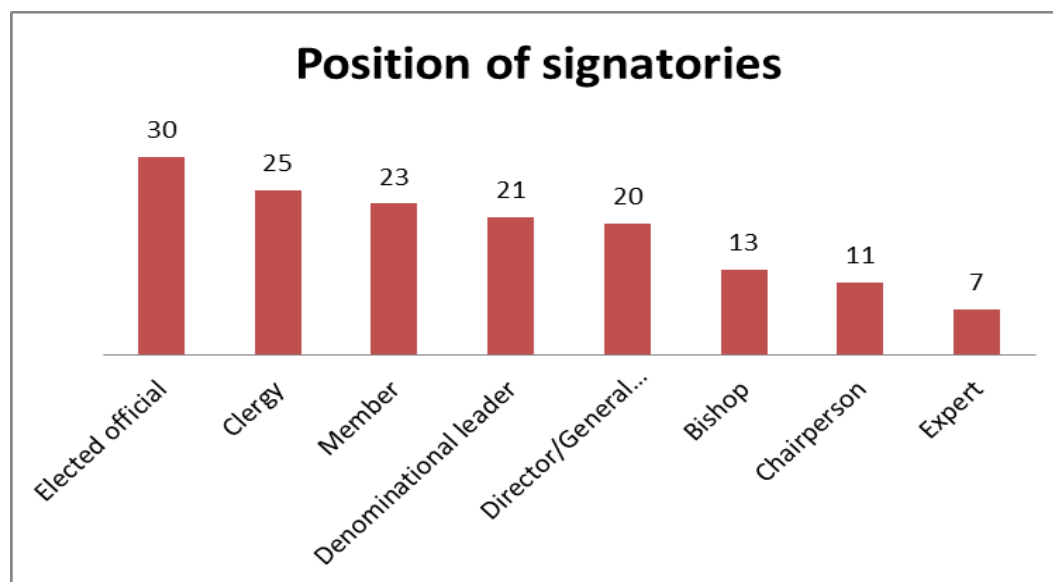
Chart 3: Position of religious signatories on the debate page of Aftonbladet between the years 2001 and 2011 ( n = 150 ).

So far the groups have been treated quite homogenously without regard to who the signatories are, apart from their religious affiliation. This section will contain how the positions of the signatories were distributed, first for the entire sample and then for the respective religious groups.