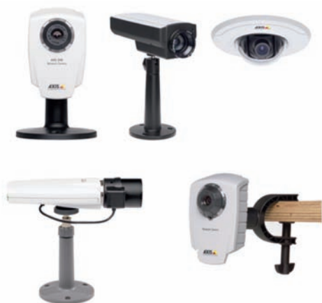
Figure 4: Prize awarded cameras. 2009 Big Design prize was given to Axis Communications AB and Zenit Design group for their camera collection. According to the jury has cameras has a good design that include whole process from design solution to installation and use.

and intentions with requirements for functions, method, material and economic solutions. The concept has both aesthetic and technical dimensions. The quality concept may be compared with soap in the bath water. When we try to establish what architectural quality is, clarity slips between our fingers. Good solutions to design problems are visible, can be experienced and can be pointed out. At the same time they are very hard to grasp. There is something that escapes, is ambiguous, in the phenomenon and usage of the concept. Fault free and correctly dimensioned plans do not guarantee that a structure results in a positive quality experience. A well proofread manuscript free of typographical errors does not necessarily communicate an interesting message to the reader. Quality has to be more than zero defects. There must be an enhanced value for the object, an addition to the environment that communicates a feeling of quality to the user.