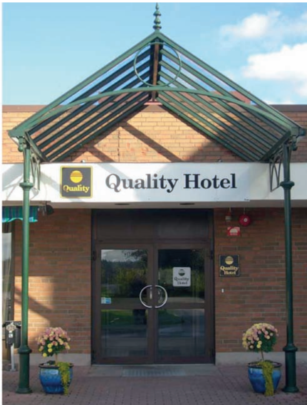
Figure 2. The entrance to the Quality Hotel in Vänersborg. The sign promises quality. The concept of quality seen here reflects the hotel providing "good service" to the guests.

perspective. Giving a product certain characteristics can ensure future quality. But that is not enough to fulfil technical specifications. Customers' requirements and expectations must also be met. This is another example of subjectivity and the return of emotions in decision-making. Quality work should lead to products that win customers' approval in a competitive market. Products may be ascribed a reputation for quality through advertising campaigns and alluring photos. Two researchers who have greatly influenced the development of the quality technique in trade and industry are the Americans Joseph M. Juran (1904-2008) and W. Edwards Deming (1900-1993). Another important person is Philip Crosby (1926-2001) who introduced the concept of zero defects as right quality.