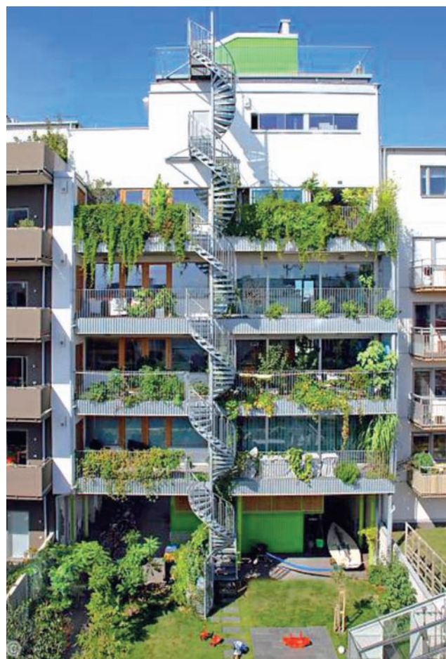
Figure 5: Housing In Malmö. 2009 Kasper Sahlin prize went to a housing project in called "urban villas". The prize is established by the Swedish Association of Architects and has high status. According to the jury the project is characterized by the architects engagement approach to sustainability and community and will contribute to a good life for its inhabitants.

A subjective position need not be problematic as long as the departure point is a personal meeting. Credibility in such quality assessments can be sought with the person who passes judgment and how it is justified. The subjective position is an aesthetic choice and is justified through learning and knowledge. The more educated the assessor the more credibility given to the subjective quality experiences. We trust the assessments of well-educated and experienced persons