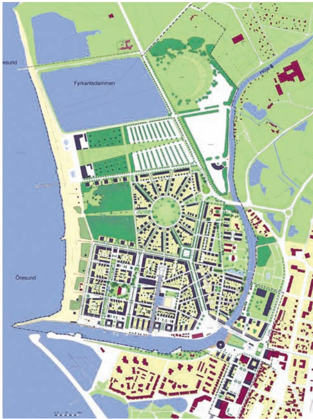
Figure 6. Awarded urban design. The illustration shows the development plan of Lomma harbour, located at Öresund. The urban design was 2005 awarded the planning prize by the Swedish Association of Architects. According to the jury the urban design of plan could be characterized as high architectural quality, a clear vision and a well-executed cooperation with age existing buildings in the area.