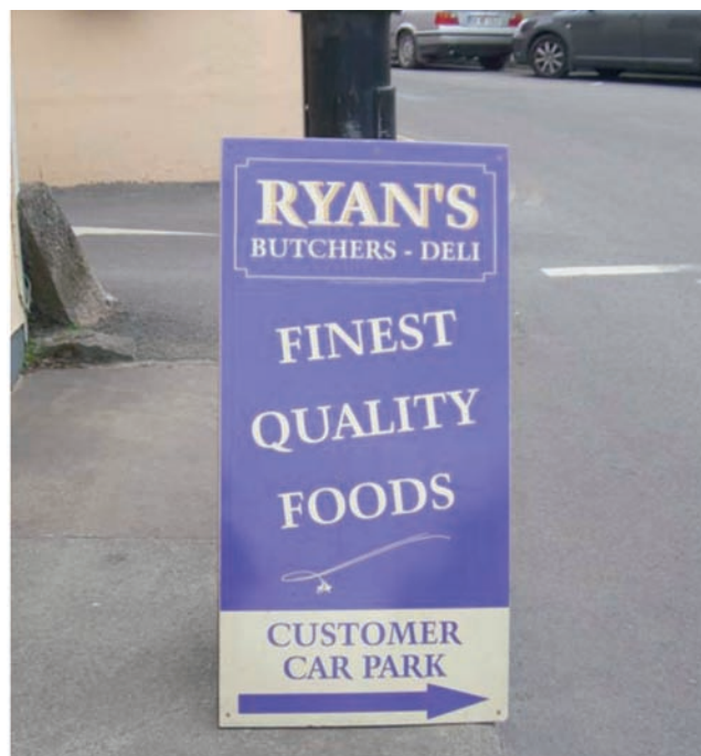
Figure 1. The photo is showing a butcher in a small town in Ireland promoting meat products. Quality is used in this case in the sense of "good food".

Secondly, quality can refer to a certain type of material or technological production of a product. Customers and controllers can ask about the quality of products on offer. Lumber yards advertise quality wood. Perhaps as a customer I want to know how the quality was determined, what material was used or which performances the technical solutions