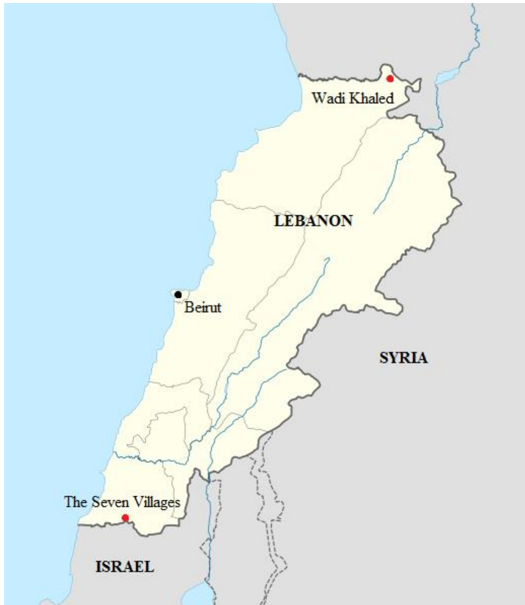
Map 1: Location of Wadi Khaled and the Seven Villages.

The 1932 census and the implications for those who were excluded have not diminished over time because the census played a crucial role in the Lebanese nation-state building process, becoming one of the key pieces of citizenship legislation regarding who was and was not to be considered ‘Lebanese’ (Immigration and Refugee Board of Canada 2002). Realising complications had arisen from large groups within the population being excluded from the 1932 census, the Lebanese government sought to partially address the issue and in 1958 a Nationality Decree was passed which granted under-stay status to some stateless persons who were not