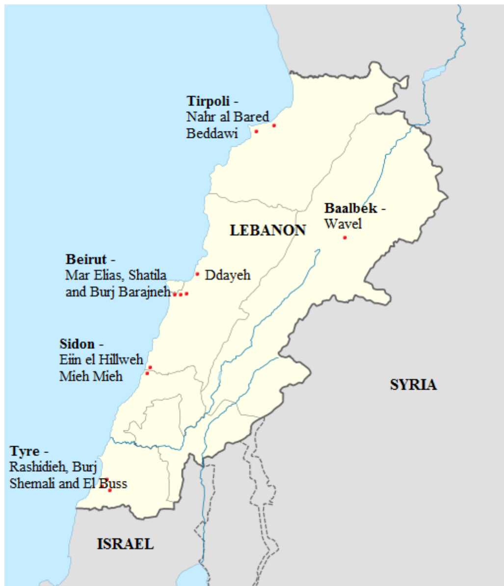
Map2: Palestinian refugee camps and settlements in Lebanon after the civil war

In the post-war period the marginalisation of the Palestinians continued. In 1991 the Casablanca Protocol was amended, changing the obligation of UNRWA and hosting states to only providing humanitarian support for the Palestinians, thus creating a “critical ‘protection gap’ that opened the door for systematic legal discrimination against the refugees” ( ibid :18). Further laws have been brought in specifically targeted at reducing permanent settlement as a solution to the Palestinian question in Lebanon, despite the evidence that this is not the goal of many Palestinians, who wish to safeguard their claim to future Palestinian citizenship (Frontiers Ruwad Association