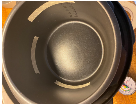
Figure 6: Three pieces of autoclave tape on opposite sides, before pouring the water in and before being exposed to any type of pressure and heat.

The pressure cooker had 8 programs to chose from, and for every program there were 3 different settings for the pressure called "LOW", "MEDIUM", and "HIGH". The pressure for the setting "LOW" was 55.16 kPa, for "MEDIUM" 75.8 kPa and for "HIGH" 100 kPa. The high pressure option was used in every test, because it was believed that the temperature will increase with an increasing pressure. This was motivated by the ideal gas law, as long as the volume is constant the temperature will increase if the pressure increase.