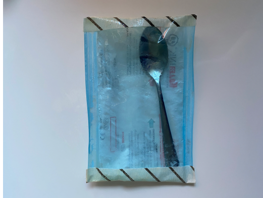
Figure 9: A metal spoon inside the sterilization pouch, sealed by autoclave tape. The autoclave tape had developed black stripes, thus indicating a temperature between 120-130 °C was reached.