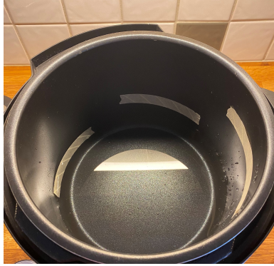
Figure 7: Three pieces of autoclave tape on opposite sides, one under water, before being exposed to any type of pressure and heat.

A time limit was chosen based on how long an autoclave cycle is and how long it takes to sterilise in Mozambique, according to the research and interviews made. It is beneficial to keep the the time as short as possible. The programs that had a time minimum limit of more than 2 hours were not used. Neither were programs that could endanger objects or people used. Thus, only 5 programs remained. The programs were tested according to the order in Table 1.