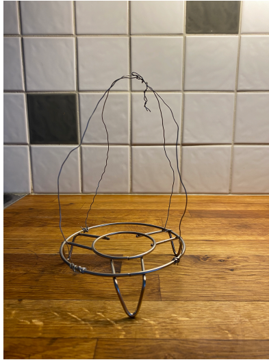
Figure 1: The metal grill with the wire handles.