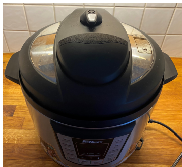
Figure 3: The pressure cooker from above.