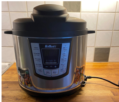
Figure 2: The pressure cooker from the side.