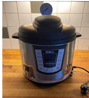
Figure 5: The pressure cooker with a manometer installed on the lid.