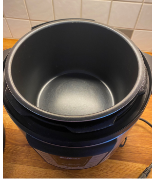
Figure 4: The inner chamber of the pressure cooker.