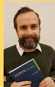
“Ett politiskt bygge: - översiktsplaneringens innehållsmässiga utveckling” by Jimmie Andersén - TIFP