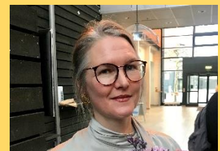
“Ta plats: Plats-specifika spel i dialog med feministisk teknovetenskap” by Annika Olofsdotter Bergström – DITE