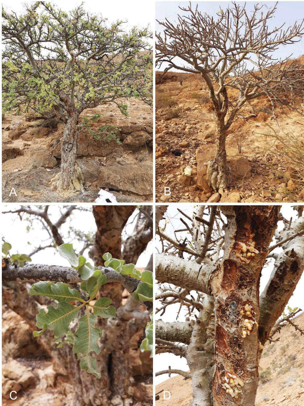
FIGURE 2. Boswellia occulta , from the type locality A. Tree, in leaf; B. Tree, showing swollen disk-shaped base when growing on rock; C. Branches, showing foliage; D. Trunk with incisions, showing resin oozing out.

Tree , up to 5 m tall, branching from the base or with a single distinct trunk; base of trunk \pm swollen and disk-shaped; bark greyish or greyish brown, smooth or somewhat flaking; branches spreading, young shoots glabrous; resin copious, milky, drying pale yellowish brown. Leaves densely crowded at shoot-apices or alternate on young long-shoots, simple, glabrous or minutely glandular along veins above, bluish-green; blade 40–120 \times 20–45 mm, elliptic-oblong, cuneate to truncate at the base, obtuse at the apex, with mostly strongly undulate-sinuate margins, sometimes lobed to the midrib or almost so; midrib prominent, lateral veins 10–15, tertiary venation reticulate; petiole 5–20 mm long. Flowers bisexual, produced with the leaves, in 10- to 20-flowered racemes, up to 80 mm long, clustered at ends of short-shoots; peduncle 15–20 mm long, glabrous, sulcate; rachis glabrous, sulcate; pedicels 2–5 mm long, glabrous; bracts ovate, apiculate, ca. 1 mm long, ciliate; bracteoles inserted near middle of pedicels, linear-lanceolate, ca. 0.5 mm long, ciliate. Calyx cup-shaped, ca. 1.5 mm long, with 5 short, broadly triangular, obtuse to subacute lobes, glabrous except for minutely ciliate margins. Petals 5, white, 4–5 \times 2.0–2.5 mm, spreading or reflexed in open flowers, elliptic, with an acute incurved apex, glabrous on outer surface, papillose on inner surface and along margins. Stamens 10, inserted at