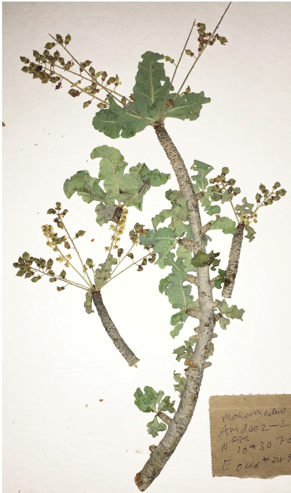
FIGURE 1. Holotype of Boswellia occulta , with field label and still unmounted.

Boswellia occulta differs from B. frereana by its flowers with white (vs reddish or greenish red) petals and tubular (vs flattened) disk, and fruits with 4–5 [vs (5–)6(–8)] locules; and from B. sacra by its glabrous (vs \pm densely pubescent) leaves with mostly strongly undulate-sinuate (vs crenate to subentire) margins, and unwinged pyrenes (vs pyrenes often more or less surrounded by a persistent wing); and from both B. frereana and B. sacra by its simple (vs imparipinnate) leaves.