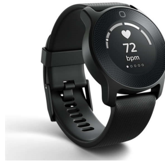
Figure 1: The Philips health watch.

Initially, a risk assessment of the health status of the worker will be carried out, making use of Goldberg’s General Health Questionnaire [9]. If the health situation of the worker is especially complex, the platform will communicate it, avoiding sending messages and notifications that may entail a risk. The user could control the maximum amount of notifications to receive per day (except for some priority