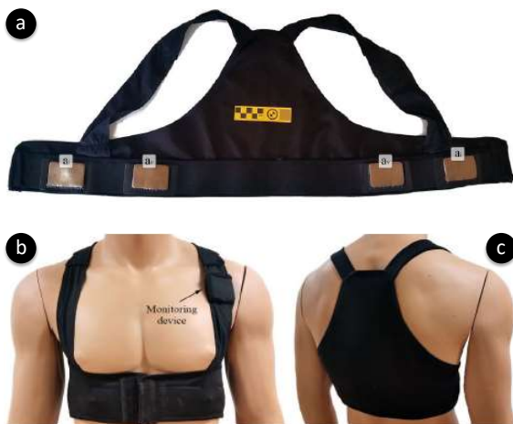
Figure 2: Textrode Sensorized Vest;(a) electrode placement in the inner side view (b) front view and monitoring device, (c) back view.

Once these variables are stored in the system, algorithms developed by Karolinska Institutet and KTH Royal Institute of Technology (KTH) will be applied, in order to check if the values are inside pre-established ranges. If these ranges are surpassed, an alarm signal will be produced by the system, notifying the worker through the Pocket mHealth, he/she may inform his/her manager, and they may together search for solutions.